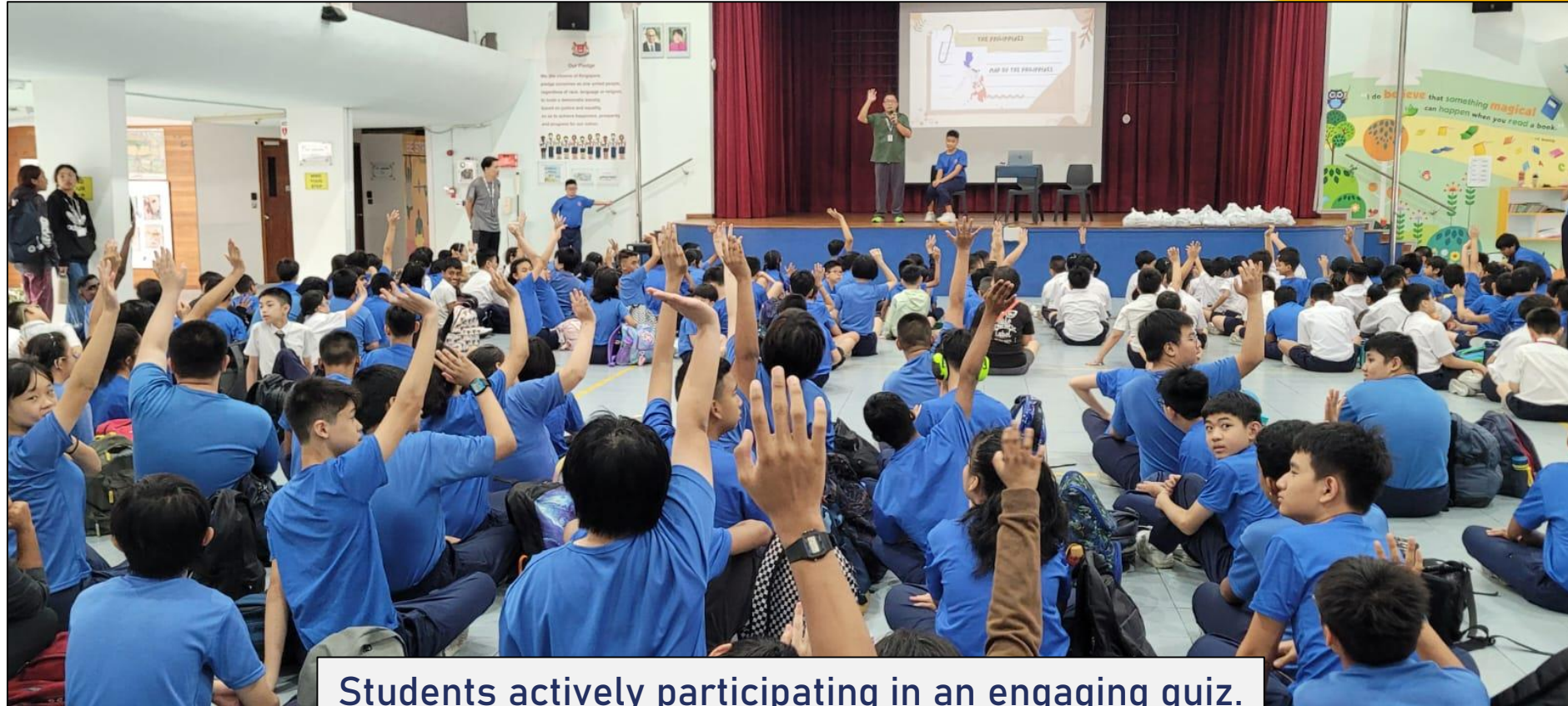
Students actively participating in an engaging quiz.

Students celebrated International Friendship Day through a week of meaningful activities starting 7 April. Aligned with this year's theme, "Forging Friendships in a Complex World," the celebration promoted cultural understanding, empathy and connection across borders.