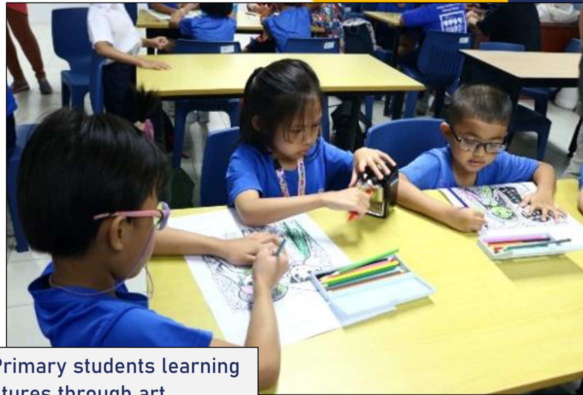
Collaboration in action—Primary students learning about different cultures through art.

Across both levels, students learned that building friendships in a complex world begins with openness, empathy and respect. They also recognised that kindness is key to forging friendships across cultures and deepened their appreciation of Singapore’s place in a culturally diverse world, particularly among ASEAN countries.