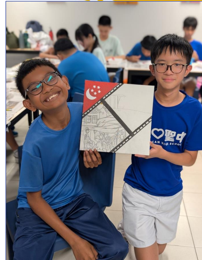
Students proudly display their completed artwork, celebrating their shared efforts and friendships.