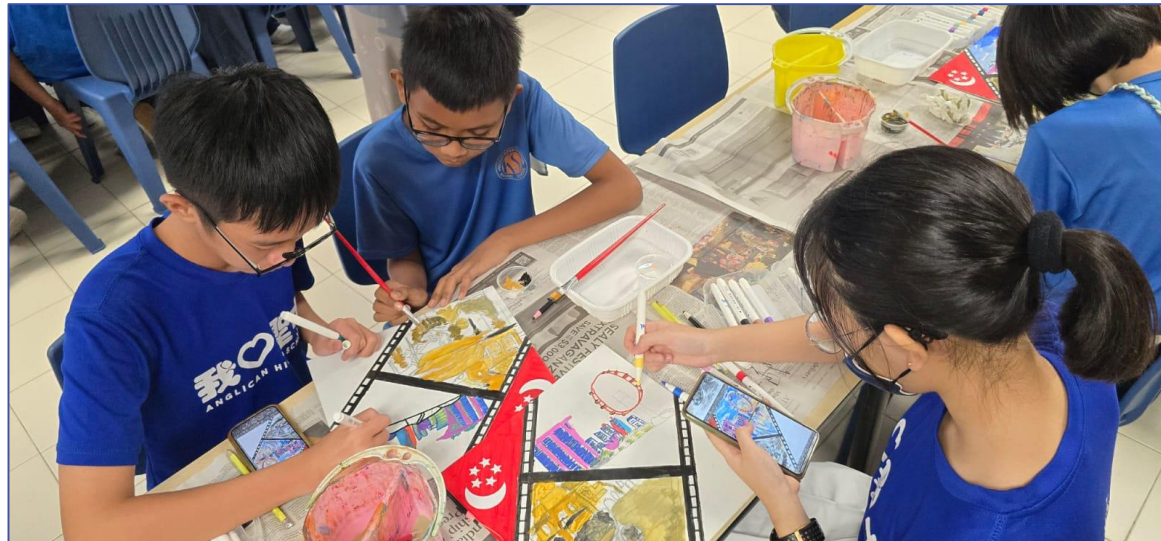
Focused and engaged, students work together on their artwork, embodying the spirit of inclusivity and unity.