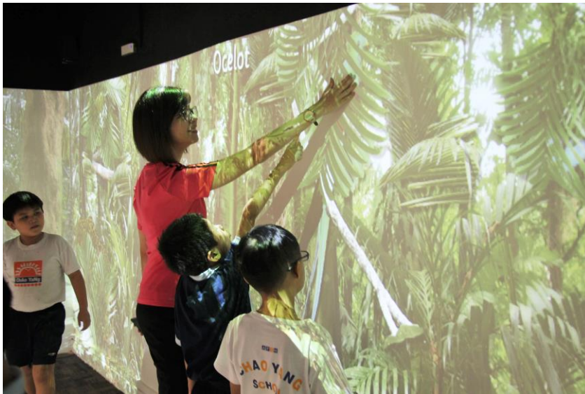
An APSN CYS teacher shows her students how to locate animals hidden beneath the foliage. Upon contact, a picture of the creature and its name will appear.