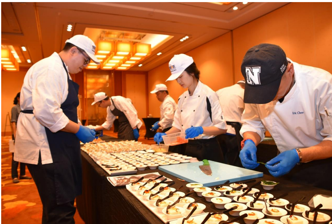
APSN Centre for Adults trainees prepared Canapé for guests at the cocktail reception.

employability. Through its establishment, APSN hopes to foster interaction between the public and our trainees, helping employers to understand their capabilities, as well as, building acceptance towards an inclusive society.